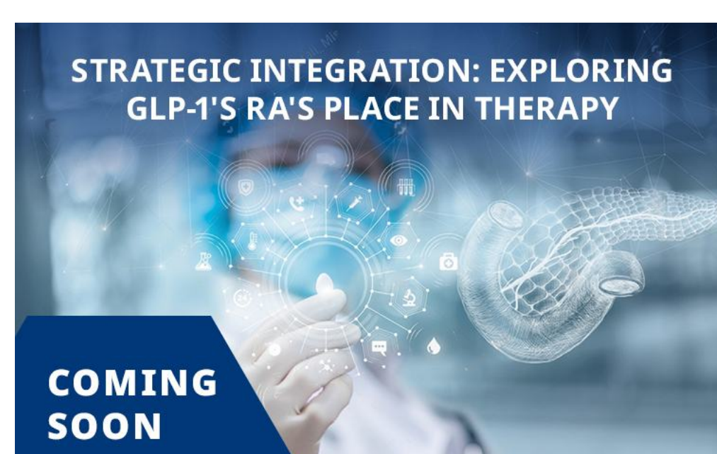
3. Strategic integration: Exploring GLP-1 RA's place in Therapy (guidelines)