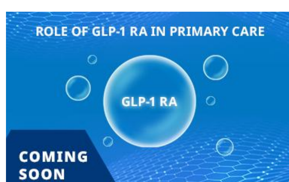
5. Role of GLP-1 RA in Primary Care