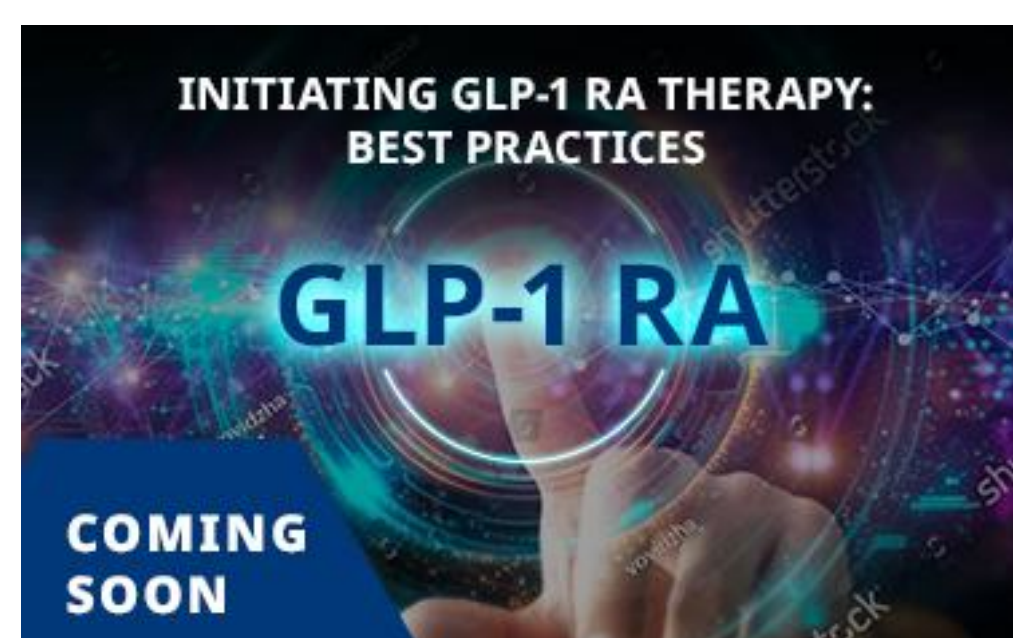
7. Initiating GLP-1 RA Therapy: Best Practices (This topic can instead be on Striking up a Patient Conversation for GLP-1RA)