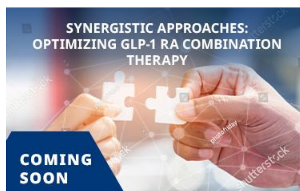
8. Synergistic approaches: Optimizing GLP-1 RA combination therapy