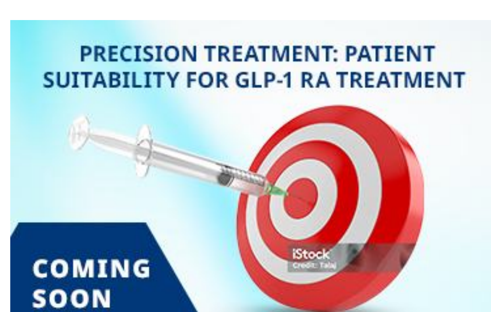
6. Precision treatment: Patient Suitability for GLP-1 RA Treatment (Decisions – Patient Suitability)