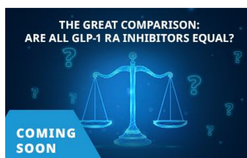
4. The great comparison: Are all GLP-1 RA inhibitors equal?