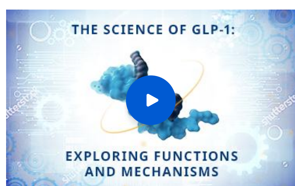
1. The science of GLP-1: Exploring Functions and Mechanisms