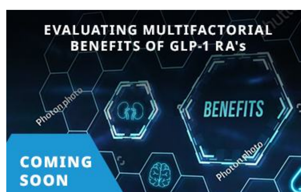
2. Evaluating multifactorial benefits of GLP-1 RA's